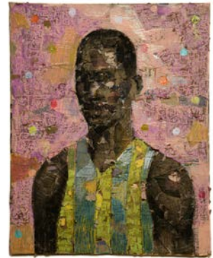
No.36 oil, pastel, acrylic, and charcoal on newsprint 24 x 30 in. 2014